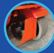
NEW 1KW WHEEL MOTORS