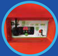
NEW BATTERY CHARGER WITH DIGITAL DISPLAY