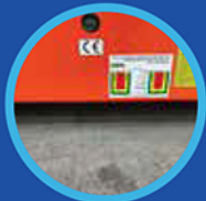
INCREASED GROUND CLEARANCE