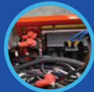
NEW ZAPPI MOTOR CONTROLLER