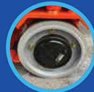
LARGER DIAMETER WHEEL ASSEMBLY