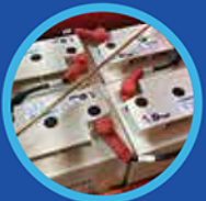
NEW GERMAN HOPPECKE GEL BATTERIES