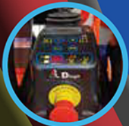
NEW PLATFORM CONTROL BRACKET