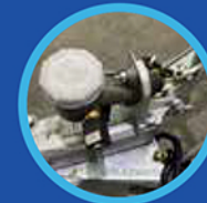
REVERSE SENSOR WITH AUTOMATIC BRAKE RELEASE